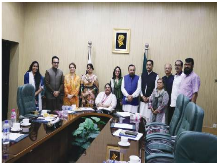
Follow up meeting with GDEWG members on BRIDGE workshop "Disability rights & Elections"

A Follow up meeting with GDEWG members after the culmination of BRIDGE workshop was held on 15th November 2024, wherein feedback was obtained from all the members who