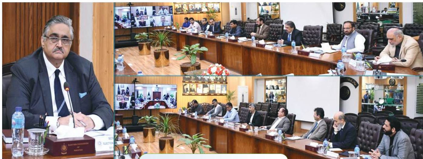
Meeting on Ballot Papers 7-11-2024