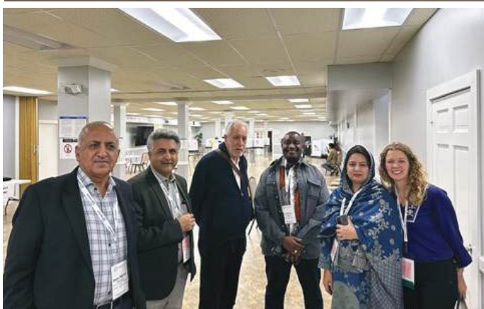
Visit to Polling Stations on Election Day