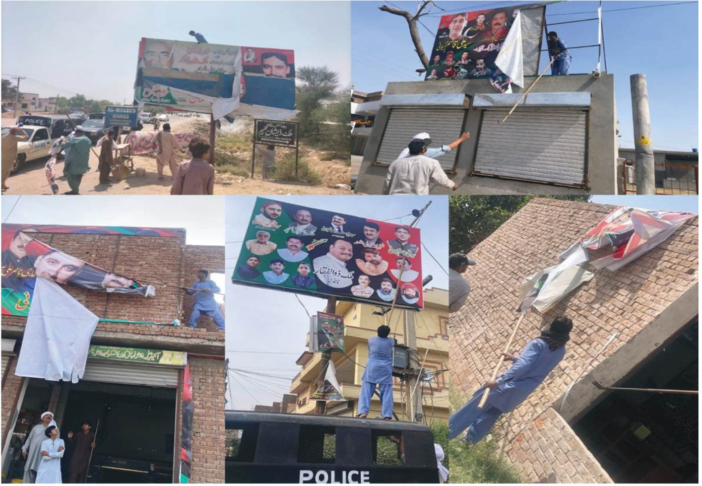
Removal of unauthorized publicity material by District Monitoring Teams of ECP from different areas during Bye-Elections in Multan & Sheikhupura,