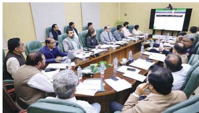
Meeting with DRO's, DEC's & Security officers for finalizing the arrangements for local government bye-elections in various district of Sindh.