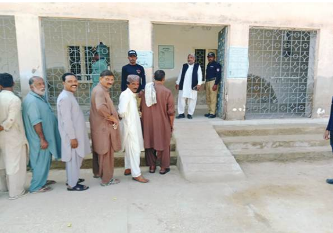
People in queue for casting their votes of LG Bye-election of Sindh province.

empowering communities through effective representation. Local authorities and observers ensured fairness throughout the process.