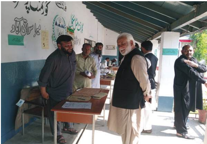
Inspecting Polling Stations during the poll hours of LG Bye-election Khyber Pakhtunkhwa.