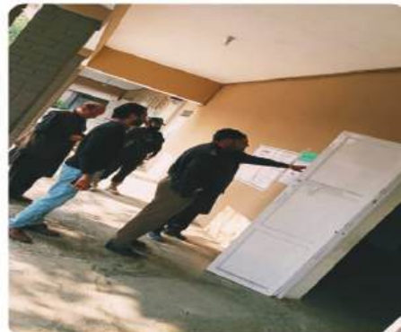
Review Security arrangements prior to the poll LG Bye-election in Nowshera Cantonment Board