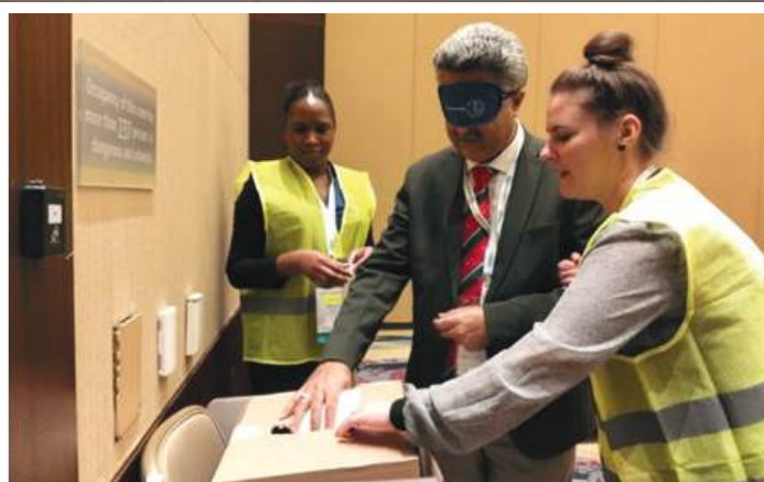
Learning simulation – casting of vote by persons with disabilities