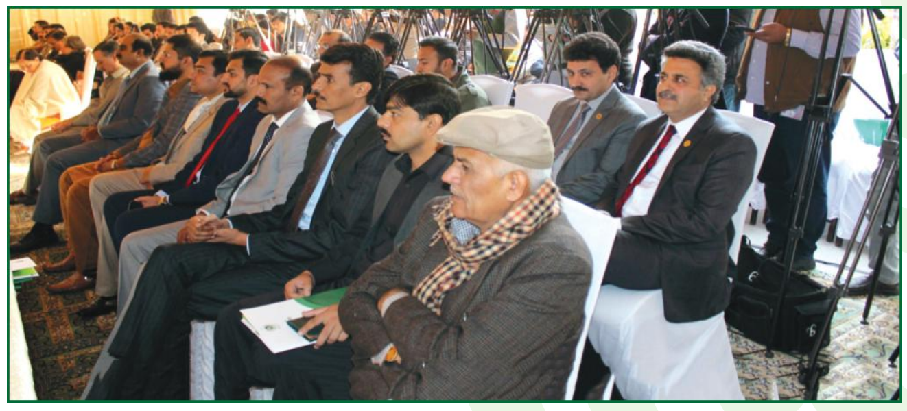
National Voters' Day being celebrated at ECP Secretariat

Similar events were also held at the provincial headquarters where Members of the Commission and Provincial Election Commissioners highlighted the importance of registration and casting of vote. The RECs and DECs also arranged several awareness activities such as awareness walks, seminars and speech contests at colleges/ schools etc.