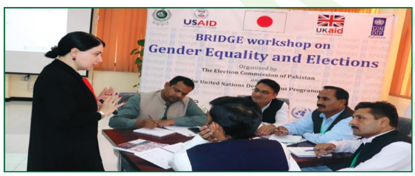
BRIDGE training workshop on Gender and Elections