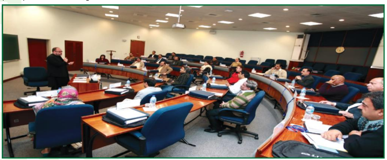
Management Excellence Programme for ECP held at LUMS, Lahore

ECP arranged a week long "Management Skills Building Course" for senior officers of ECP at Lahore University of Management Sciences from 16<sup>th</sup> to 21<sup>st</sup> December, 2020. The course covered an array of subjects including leadership, result based management, negotiations skills, strategic planning and team building. A group of 23 officers of ECP participated in this training.