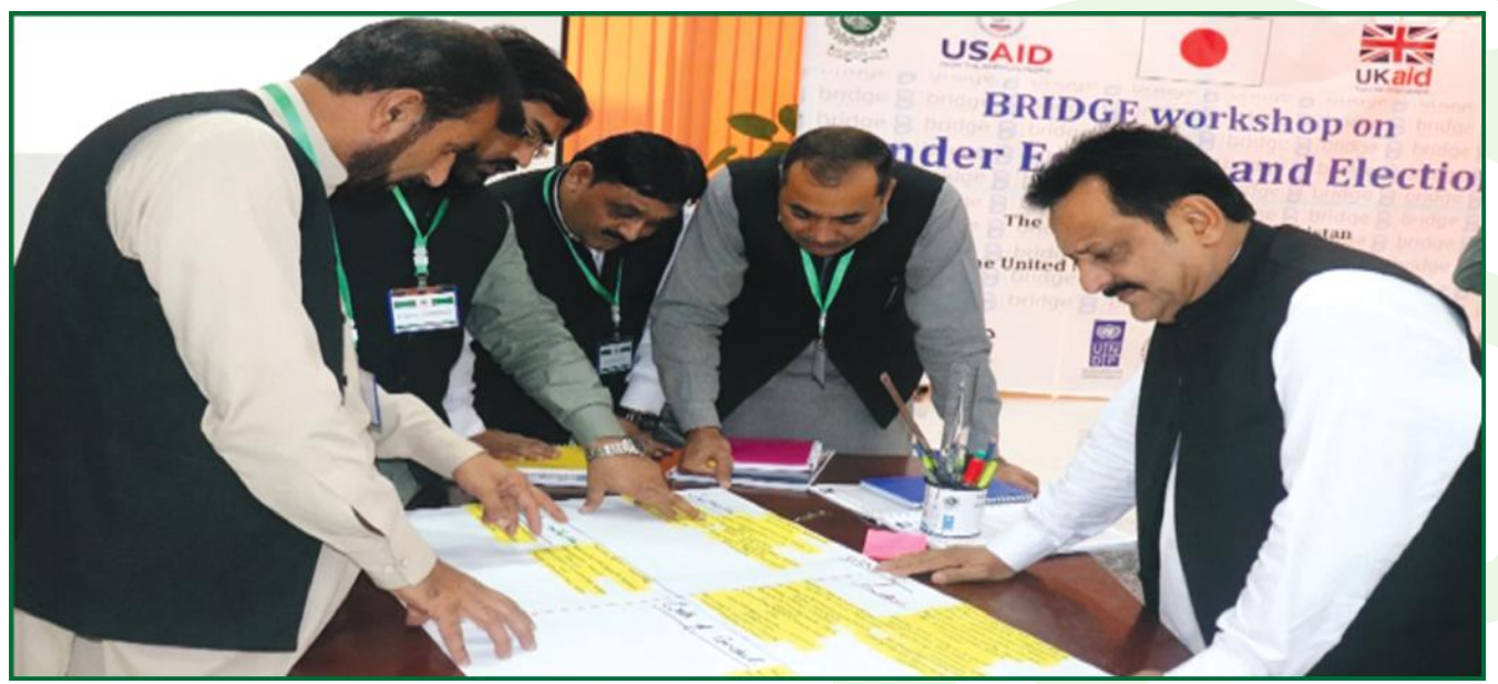
BRIDGE training workshop activities

The training of 8<sup>th</sup> batch of EMC was followed by two week long "Building Resources in Democracy Governance and Elections (BRIDGE)" training on different modules. The BRIDGE trainings were conducted on international pattern of adult learning techniques under the supervision of an International Training Expert.