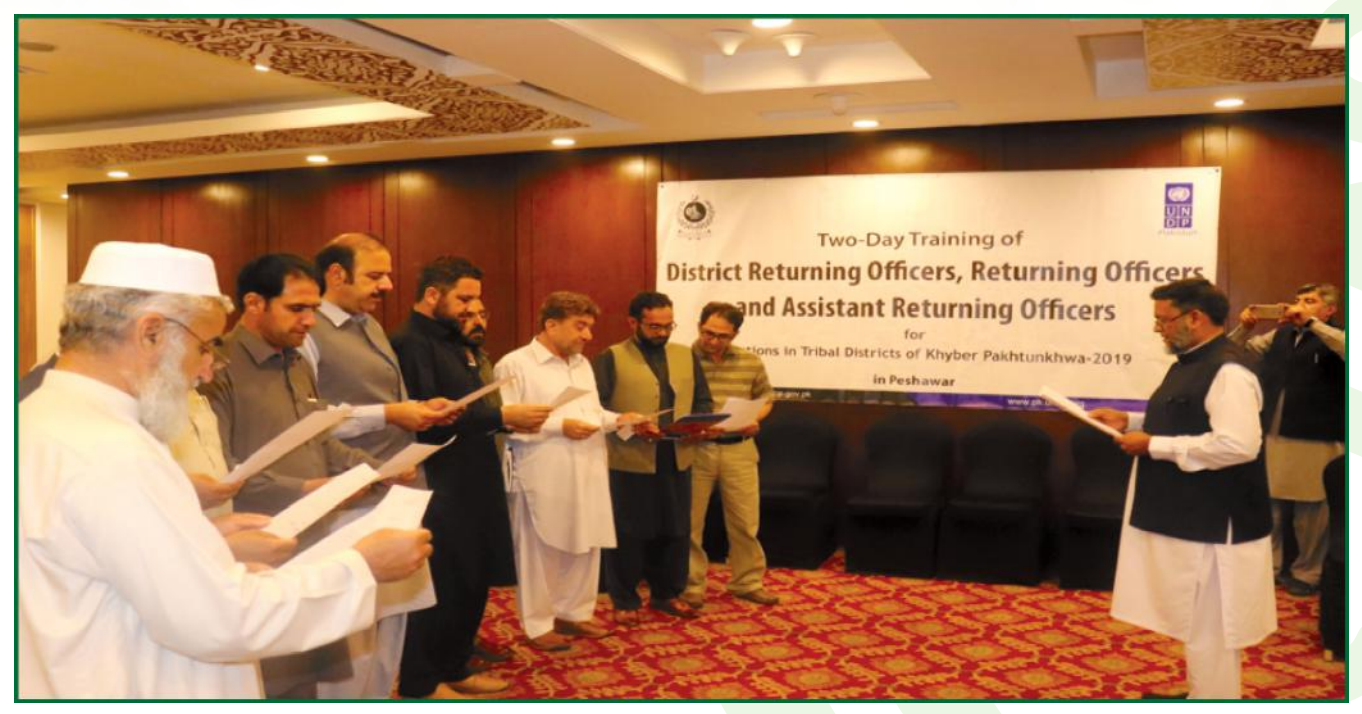
Oath Taking ceremony where DRO taking Oath from ROs Two-day Training of DROs, ROs and AROs