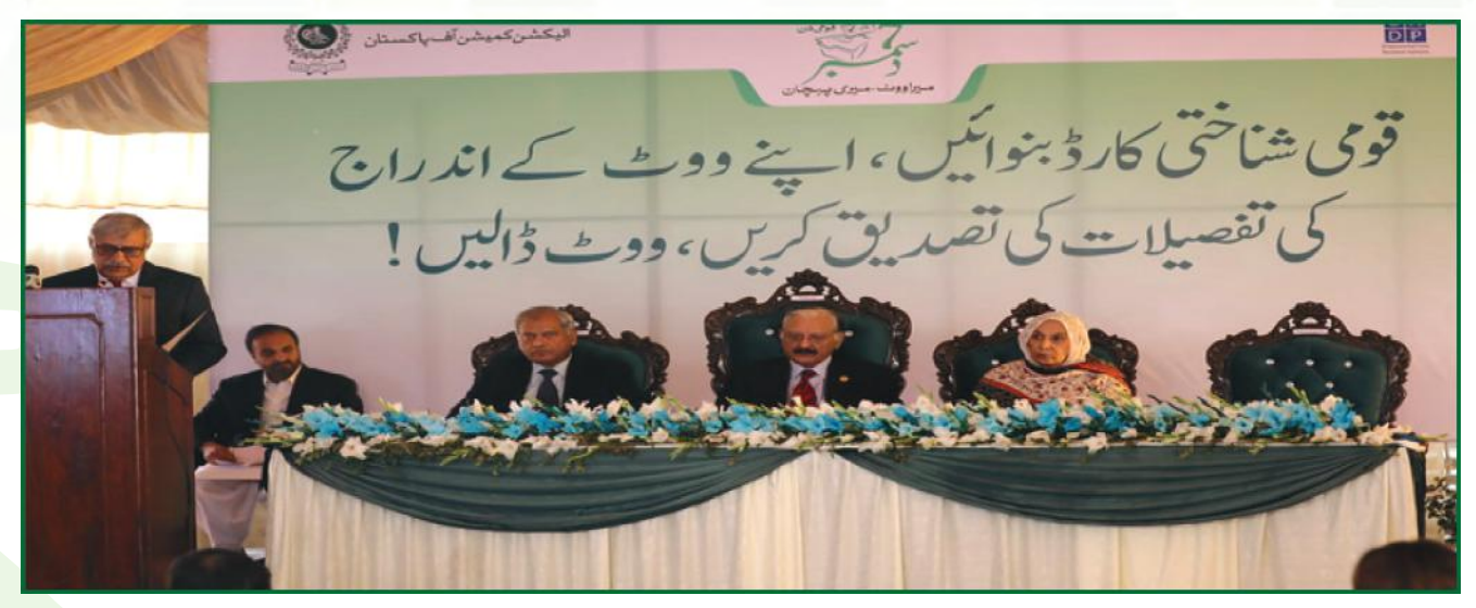
National voters' Day 2019 at ECP Secretariat, Islamabad.

The Commission commemorates and celebrates National Voter's Day on 7<sup>th</sup> December each year to create awareness among the masses about their electoral rights and obligations. The aim to celebrate the day is to make the electoral process more inclusive including women, minorities, transgender, persons with disabilities and youth.