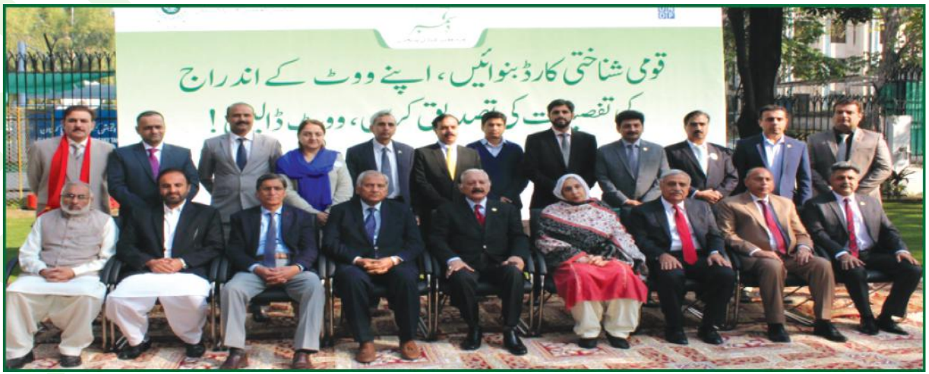
Group photo during the National voters' Day 2019 at ECP Secretariat, Islamabad.

The main function was held at ECP Secretariat, Islamabad. The theme this year for celebrating the day was to create awareness amongst general public to "register or transfer their votes as per addresses on their NICs".